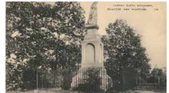
Postcard of the Hannah Dustin Memorial Statue

Dustin Island - a short walk down to the Memorial