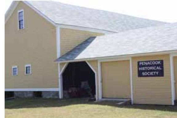
The Penacook Historical Society's 1790's Rolfe Barn recalls a rural age of farms & saw mills

Near the village center, the United Church of Penacook's 150 foot spire stands as the