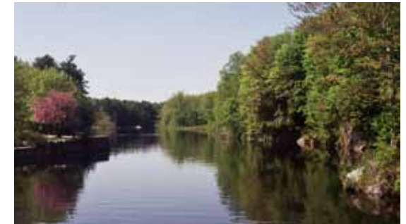
The Contoocook River played a large part in Penacook's history and is still scenic today.

Enjoy walking in three parks or canoeing two rivers, viewing ducks, geese and blue herons.