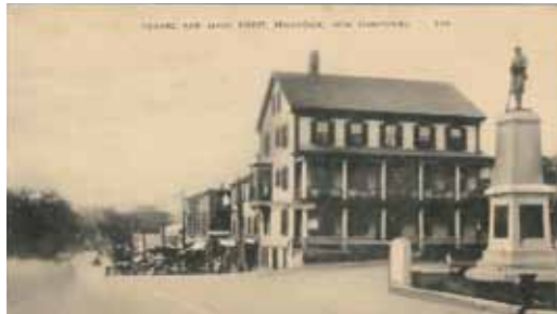
Postcard of the Village of Penacook

In Penacook you can walk past a dairy farm where cows graze in view of the Merrimack River. Pass by three houses built before 1815. Visit our library, one of our three parks or go for a swim and then eat a good meal. After a doctors or dentist visit you can walk to the pharmacy. Your children can attend our elementary, middle or high schools. All and all a friendly, quaint place to live, work and enjoy.