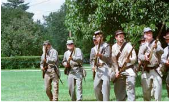
Penacook Civil War Days sponsored by the Penacook Historical Society takes place on the Rolfe House Grounds

Penacook Farmers' Market - June thru Oct.