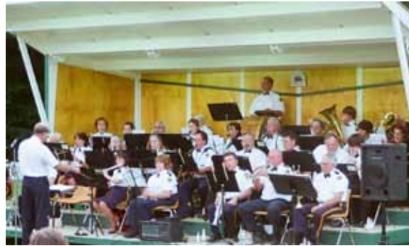
Village of Penacook -Concerts at Rolfe Park